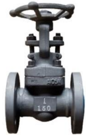
ANSI 150# Flange End Gate Valves